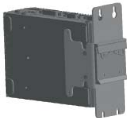
Side Mount DIN-Rail