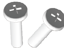
M4x12 Drywall Screws