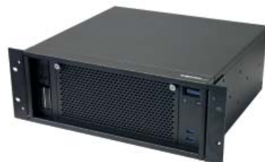
Rack mounting (front)

All brand, company and product names are registered or otherwise protected works of their respective companies / owners. We reserve the right to change specifications and product description at any time without prior notice. (Stand August 2023)