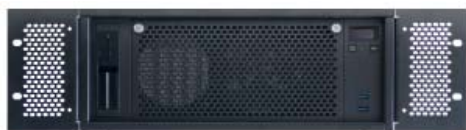
19" Rack Mounting with optional 19" Brackets