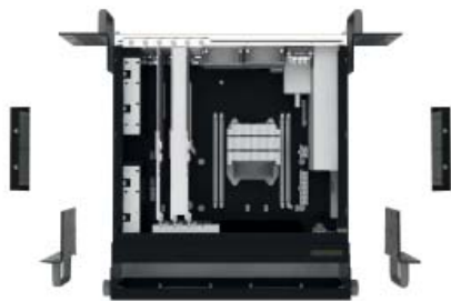
Wall-, Rack-, Table-, Under-table Mounting with Brackets included in packing list