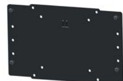
VESA Mount kit