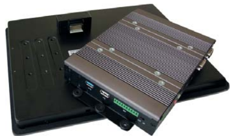
PC Module + Display = Panel PC