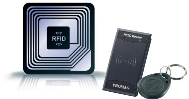
Components for an external RFID reader solution